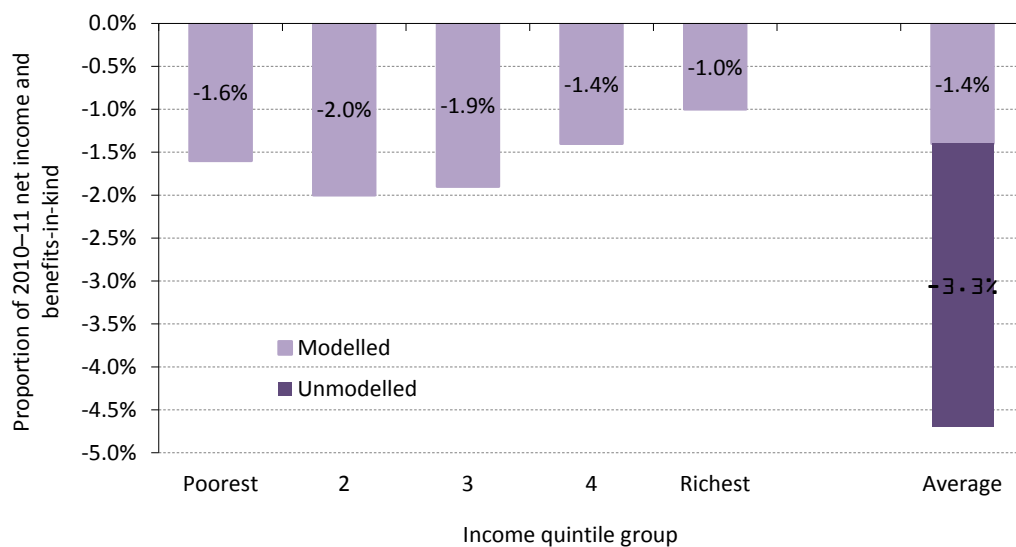
FIGURE 2 UK Treasury Analysis of Impact of Planned Cuts in Spending on Public Services, Between 2010/11 and 2014/15: Model and Spending Plans as of Spending Review 2010

The second point we wish to make in comparing the two graphs is that after the Spending Review in 2010, the Treasury released sufficient information for us to calculate what proportion of the changes in Departmental Expenditure Limits were being modelled and what were not. This allowed us to augment the ‘average’ bar in Figure 2 with the impact of unmodelled expenditure. The Treasury no longer releases information that allows us to do this. This is unfortunate. Most of the spending items that are omitted from the model are not included as different households do not use the items differentially 18 (e.g., spending on the environment) or because the extent of differential usage across household income groups either cannot be measured (e.g., for capital expenditure). In neither case is there a good reason to exclude the impact of change in spending on these items in the ‘average’ bar. Including it here means that the magnitude of the omitted items is clear, even if their distributional impact is not. At the very least, if the Treasury analysis is not to include this, it would be useful if sufficient information were published to allow external researchers to do so (as we previously were able to do).