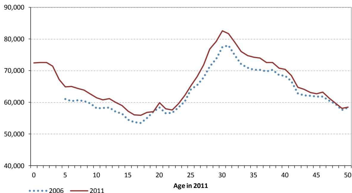
FIGURE 3.1 Population Enumerated in Censuses 2006 and 2011 , Matched by Single Year of Age in 2011

Before proceeding to a more detailed comparison between the two profiles, Ireland's unique population profile is worthy of note. The sharp peak at approximately 30 years is in part due to historic patterns of family formation and fertility, but was accentuated by the age profile of immigrants during the boom, who were mostly in their twenties and early thirties. The scale and sharpness of this peak is truly striking. In 2011, Ireland had around 63,000 45 year-olds, 83,000 30 year-olds, yet just 57,000 15 year-olds. Hence, the 30 year-old cohort is 32 per cent and 44 per cent larger again than the cohorts just 15 years older and younger respectively. Since immigration of young adults may be less likely in the future than in the recent past, the potential consequences of this steep fluctuation being maintained in the population profile merit consideration. Most obviously, while the profile explains the recent surge in the number of births, it strongly suggests that the number will fall again in coming years too. Over coming decades, it may also have implications for, among other things, the composition of tax revenues, the funding of pensions, and the demand for various health services.