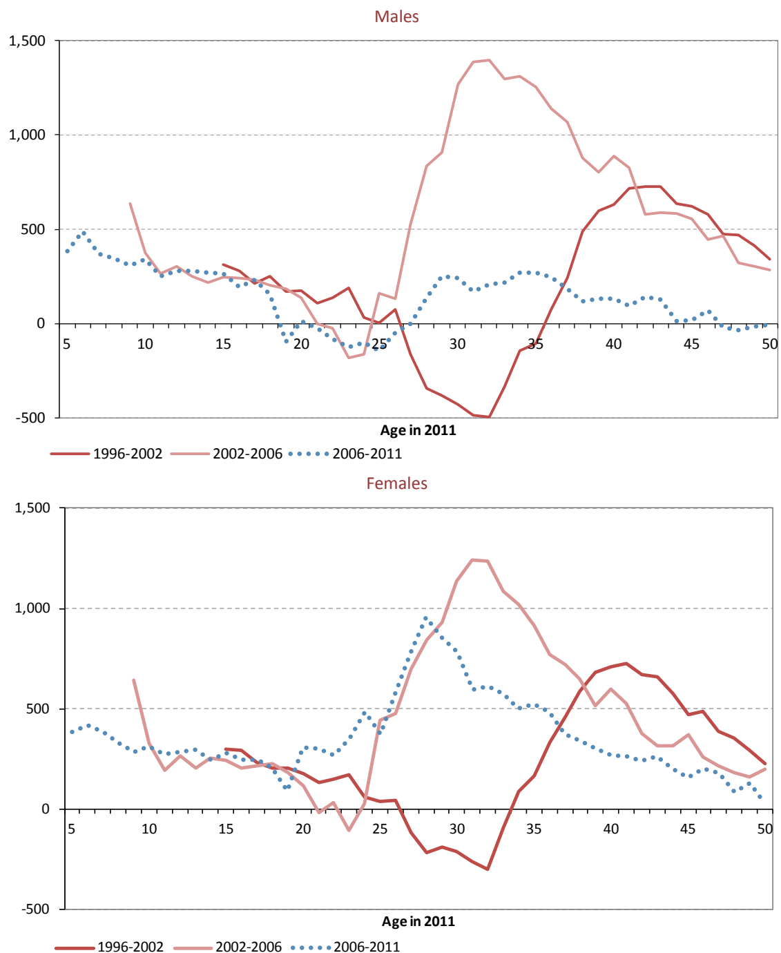
FIGURE 3.5 Annual Average Net Inward Migration by Single Year Cohort and by Gender, 1996-2002, 2002-2006 and 2006-2011

years in 2011, marginally more men had left towards the end of their teenage years (dotted line) and/or arrived in their early twenties (dashed line), but the overall patterns for men and women differed little for the earliest two periods. Between 2006 and 2011, however, the pattern altered. Net inward migration among working-age men fell substantially, with those in their twenties becoming net emigrants. Yet net migration among women changed far less. They remained net immigrants at almost all ages, but especially at 25-35 years. Net inward migration among women in their early twenties actually increased.