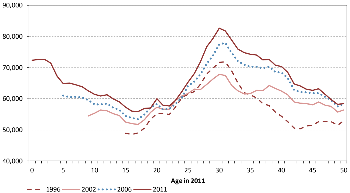
FIGURE 3.4 Estimated Annual Average Net Inward Migration by Single Year Cohort, 1996-2002, 2002-2006 and 2006-2011