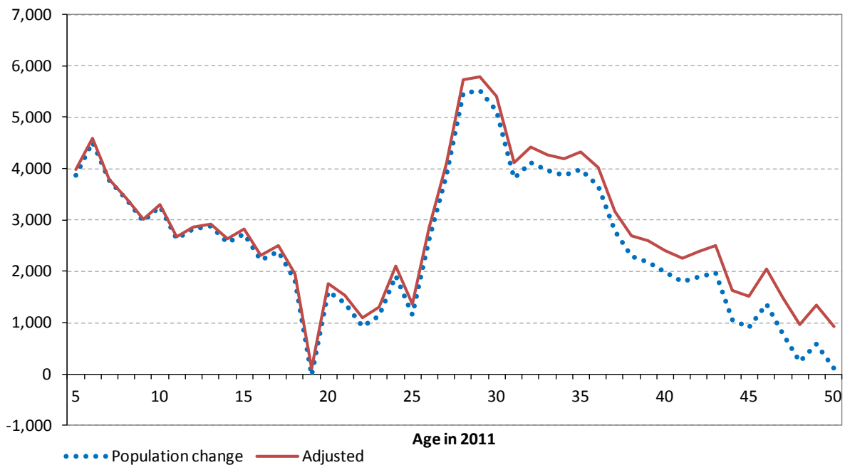
FIGURE 3.2 Estimated Net Inward Migration by Single Year Cohort, With and Without Adjustment for Estimated Death Rate, 2006-2011